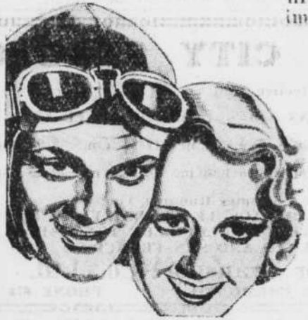
James CAGNEY Joan BLONDELL Ann Dvorak — Eric Linden

The very audacity of it made them gasp! They said no cast could stand the strain of such nerve-racking action . . . no director would attempt scenes that took such a daring gamble with human life. These thrills were impossible to film!