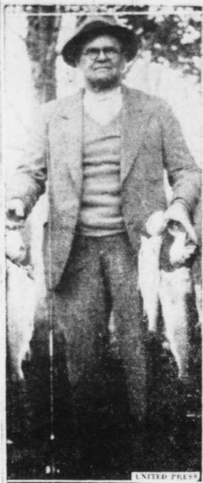
Glenn Seoby (Pop) Warner, famous football mentor of Stanford, waived football long enough to go to Pyramid Lake, Nev., where he snared a mess of spotted trout. Pop, as a football coach, may be some pumpkins but his trout were the smallest caught at Pyramid and he's in line for the resort's annual "small" trout trophy.