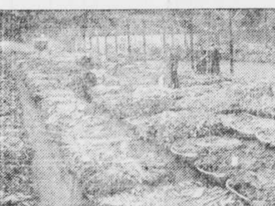
Auction today! Chesterfield buys the best