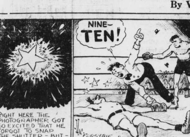
RIGHT HERE THE PHOTOGRAPHER