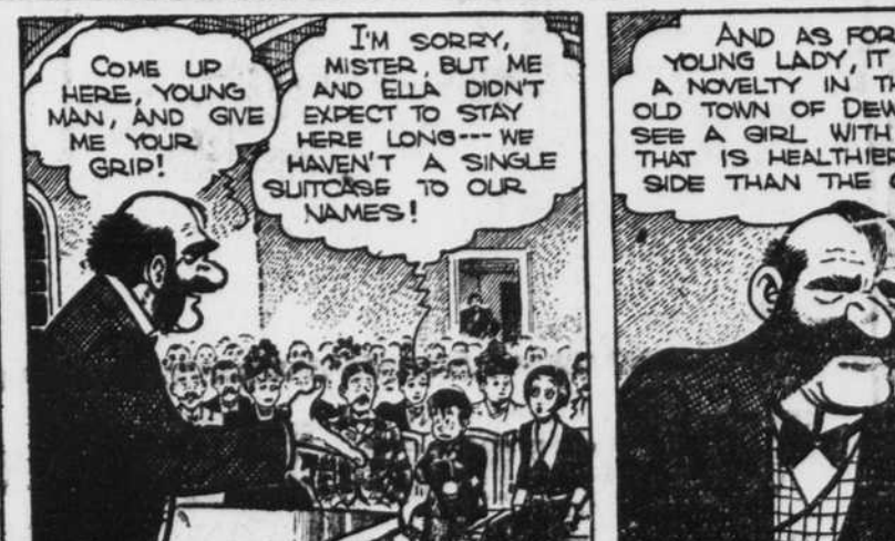
Brass Band Missing