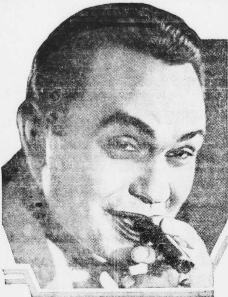
Edward G. Robinson, star of "Two Seconds," which shows a world premiere at the opening of the Palace theater Thursday night.