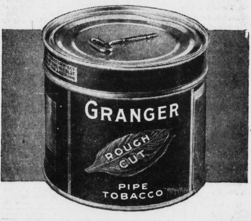
HALF-POUND VACUUM AIR-TIGHT TIN

Packed in a handy pocket pouch of heavy foil. Keeps the tobacco better and makes the price lower. Hence... 10c