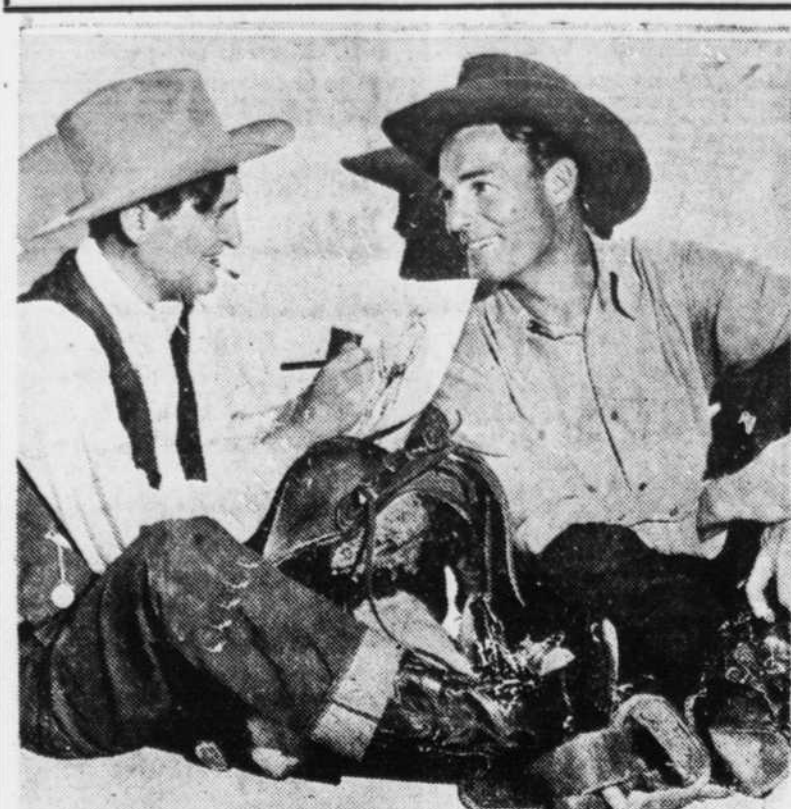
Will James, famous author-artist-cowboy, above, left, shows how he does it. Now in southern California, James, who can fork a bronc as well as he can draw, sketches Randolph Scott, right, of the talkies.