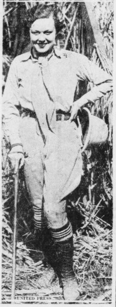
Barbara Weeks, screen actress, shown back to work with the aid of a cane the day after she emerged second best in a scuffle with a vicious leopard.