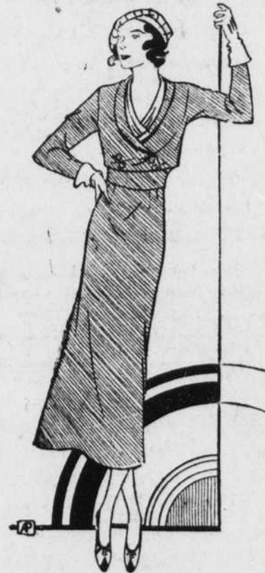
This suit with abbreviated jacket is made of very fine red jersey and is completed with a white blouse section