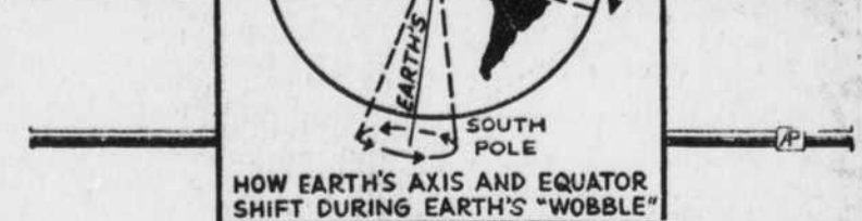
HOW EARTH'S AXIS AND EQUATOR SHIFT DURING EARTH'S "WOBBLE"

Because the Asiatic country near the north pole is larger in area than that on the American side, its weight of snow and ice is greater. This tends to make the earth heavier on that side and, in effect, shifts the earth's axis and the equator as indicated below, causing a wobble that the coast and geodetic survey is trying to check.