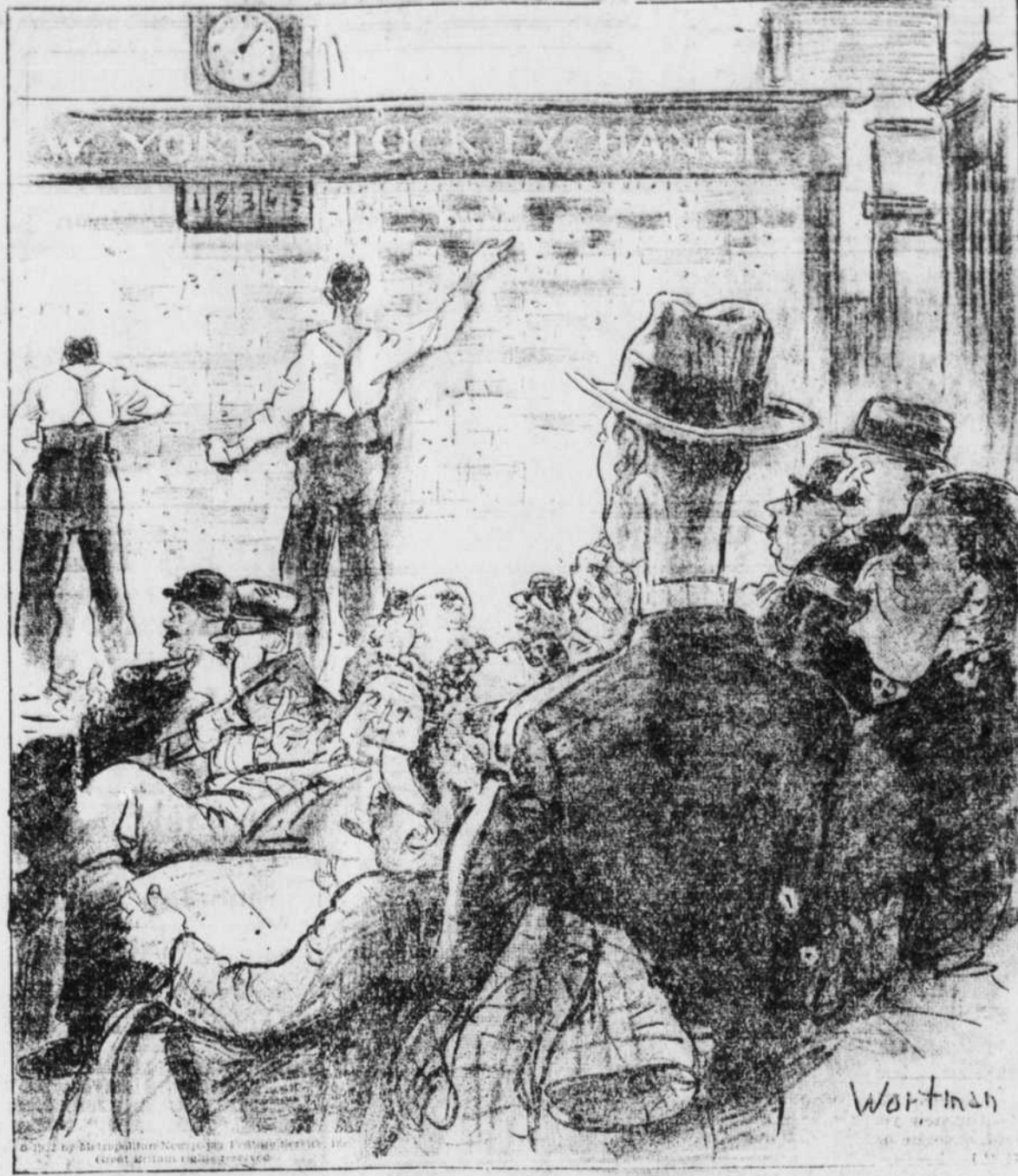
"Yeah, I took a loss, but if I'd only followed my REAL judgment I'd of made a profit."