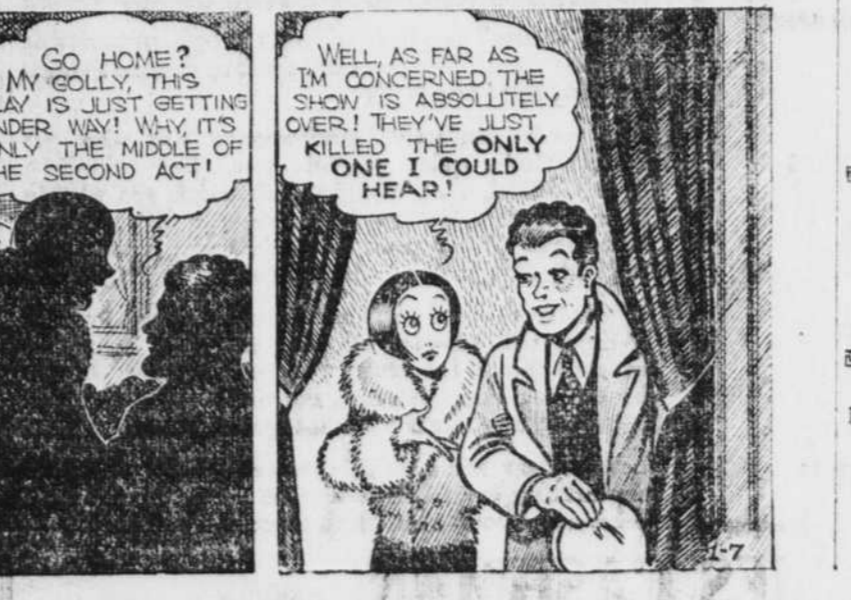
By C. B. & Pat. Gift of The Metropolitan Picture Service, Inc. Gift. British Rights Reserved.