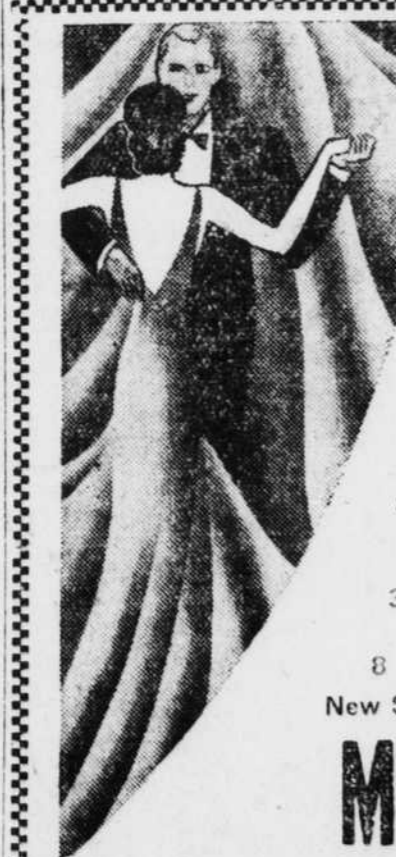
Hotel, Dining Room, Cabaret, Casino