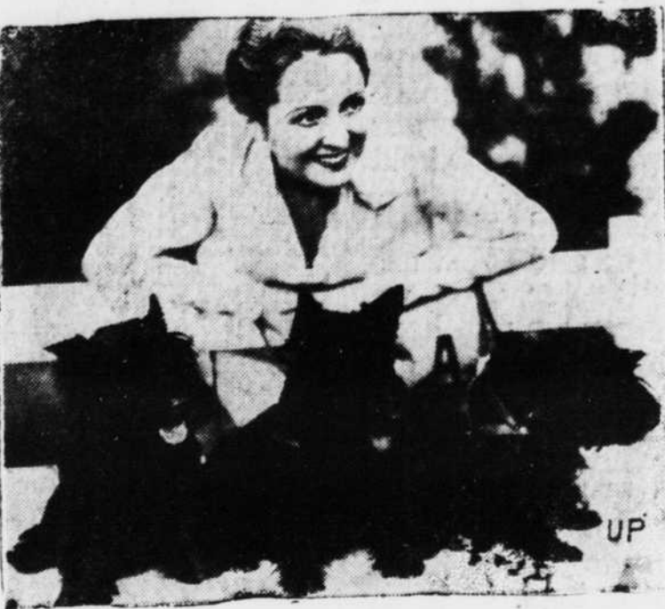
Billy Dove, United Artists film star, took sufficient time out recently from movie work to see to it that his three Scotch terriers did a bit of starrng in the National Dog show at Los Angeles. The funny-looking trio walked off with a series of blue ribbons.