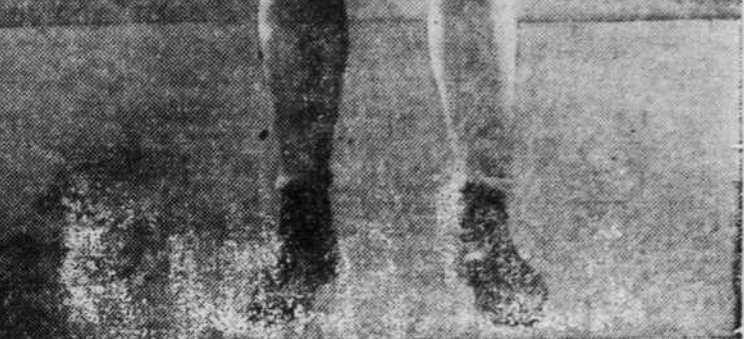
Paulino Uzcudun himself, above, who is being wined and dined, despite training rules, by the Basque colonies in Western Nevada. The giant wood chopper will attempt to make things merry for Mr. Max Baer of California, when they meet in the Reno ring for a 20-round Fourth of July battle.