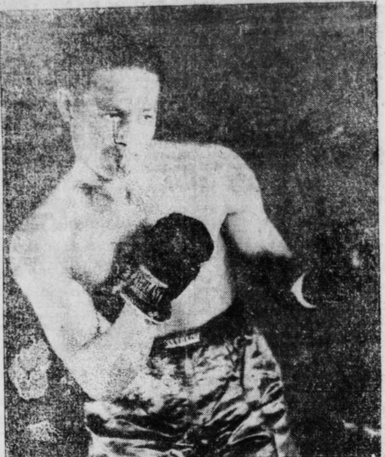
California's candidate for the heavy weight championship, whom Jack Dempsey, promoter, says is the prospect in the country. Max says his 4th of July fight program

Special to The Age RENO, June 5 —According to an announcement today by Jack Dempsey, promoter, Max Baer, California heavyweight, will start heavy training Friday morning for his 20-round battle here on the morning of July 4 with Pauline Uzdunin.