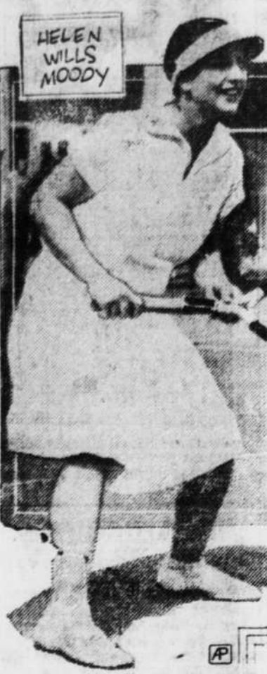
The net rivalry between Mrs. Helen Wills Moody and Helen Jacobs will add spice to the Wimbledon championships in London. Helen Jacobs is in England preparing for the tournament.