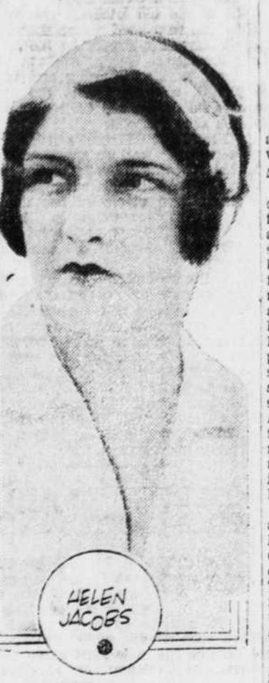
The net rivalry between Mrs. Helen Wills Moody and Helen Jacobs will add spice to the Wimbledon championships in London.