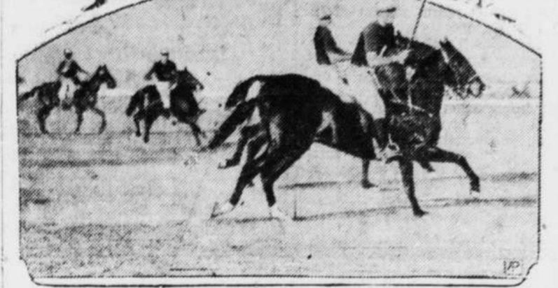
The four range-bred boys shown above will represent the University of Arizona in the intercollegiate polo tourney on Long Island...