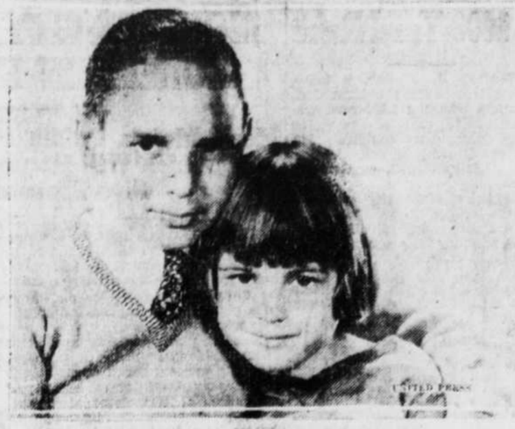
Robert Coogan, shown above with his older brother, Jackie, of "The Kid" fame with Charlie Chaplin a few years back, today at 5, the same age Jackie made his movie debut, gets his chance before the camera. The younger Coogan plays the part of "Sooky" in the filmization of the Percy Crosby novel, "Skippy."