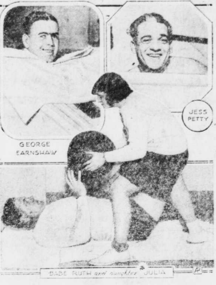
The boys already are getting into shape for the next baseball season. Babe Ruth, New York Yankee slugger, is working out in a New York gym. George Earnshaw, Philadelphia right-hander, and Jess Petty, Chicago Cub southpaw, are taking the baths at Hot Springs, Arkansas.

NEW YORK, Jan. 30 (AP)—Some of the boys are jumping the gun again. With most major league clubs scheduled not to leave for spring training until after the middle of February, reports have started to trickle in of athletes in far flung spots sweating and groaning to work off the effects of a soft winter.