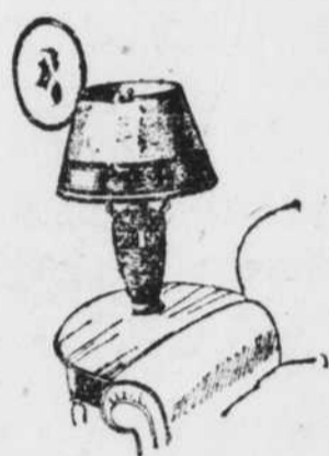
Table Lamps That Give That "Home Sweet Home" Look

The lamp pictured is one of several designs, particularly suitable for end tables, consoles, or sun parlors.