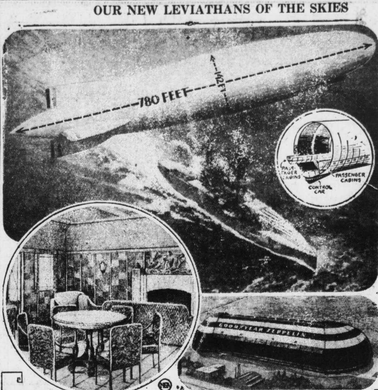
The composite picture above shows now one of the U. S. Navy's two new dirigibles, now building at Akron, Ohio, will look as compared with a battleship. Each will be slightly longer, but of much greater cubic capacity than the Graf Zeppelin. The sketch shows the enclosed construction. Below is an interior of one of the roomy cabins, and a view of the huge new hangar at Akron, now nearing completion, where the great dirigibles are to be assembled.