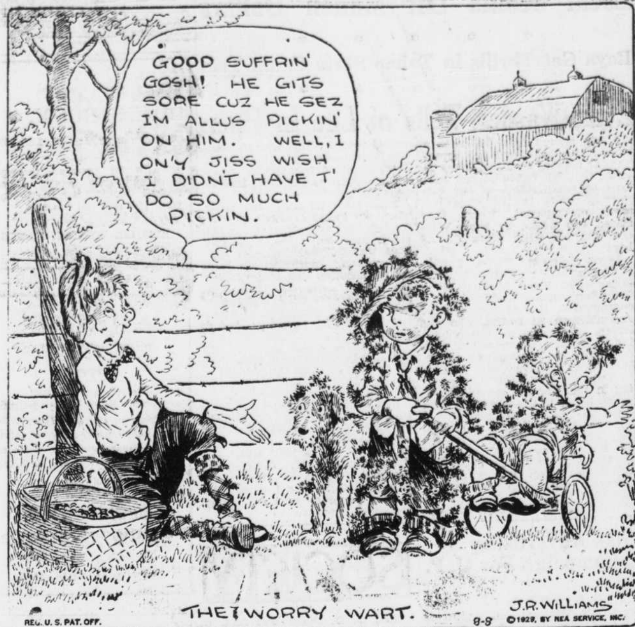
THE WORRY WART.

J.R. WILLIAMS 9-9 REG. U.S. PAT. OFF. © 1929, BY NEA SERVICE, INC.