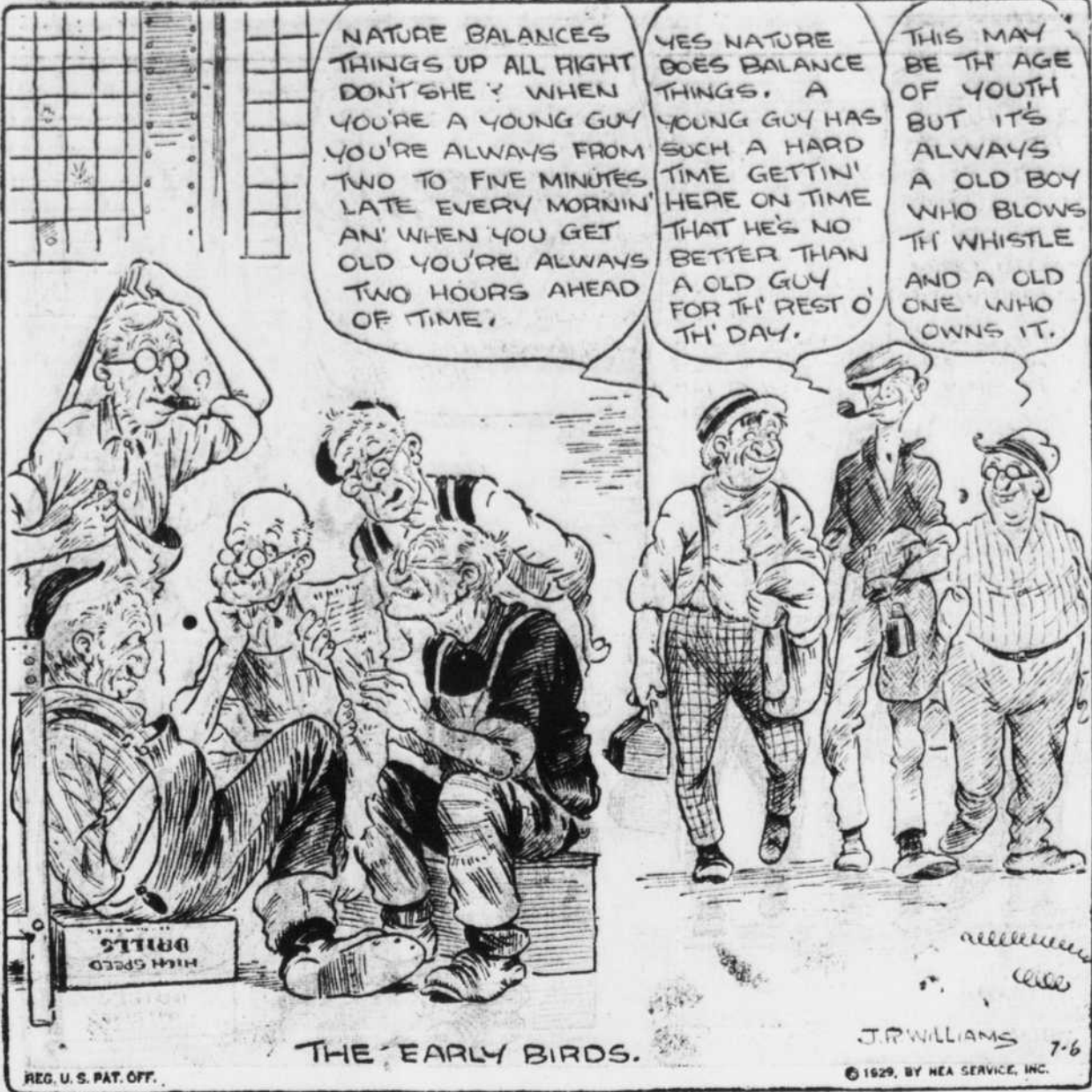
THE EARLY BIRDS.

J.R. WILLIAMS 9-9 REG. U.S. PAT. OFF. © 1929, BY NEA SERVICE, INC.