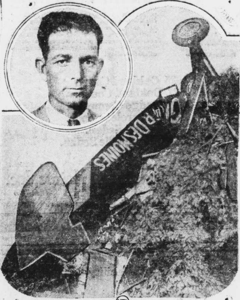
Wreckage of the "Greater Des Moines" endurance plane, in which Pilot Arnold Ross, inset, was killed when it crashed to earth at Des Moines, Ia., is pictured here. Arnold was standing in an open cockpit ready to make a refueling contact when the plane dove to destruction. Another pilot escaped by use of a parachute.