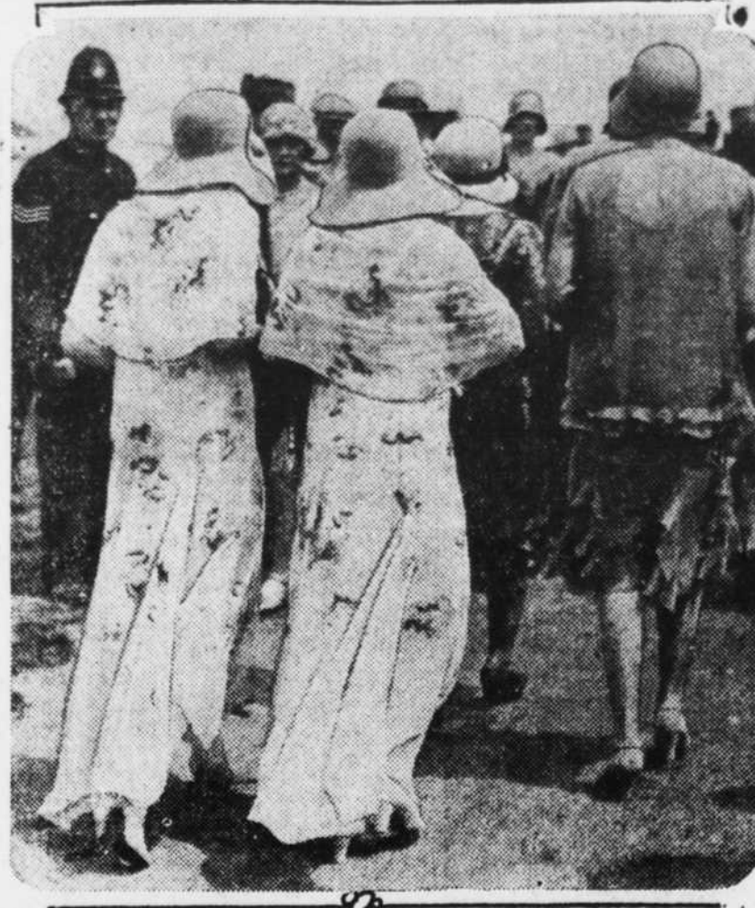
While Parisian dressmakers are reported ready to make another attempt to popularize long skirts this fall, England has already had a peek at the proposed styles—and here they are. This picture shows two duplicate models in flowered chifon, as seen at an English race course. Note the contrast between these skirts and the ones on