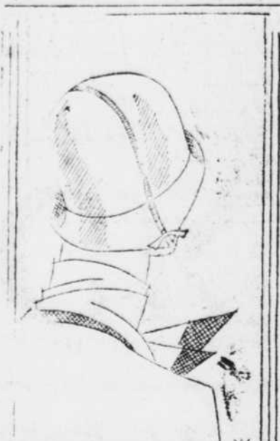
BLACK AND WHITE felt ingeniously cut and stitched together is used by Agnes in her newest design. The white inset lies in a pert bow at the back. The front part of the brim is titched down and the pieces over to cars are turned back neatly.