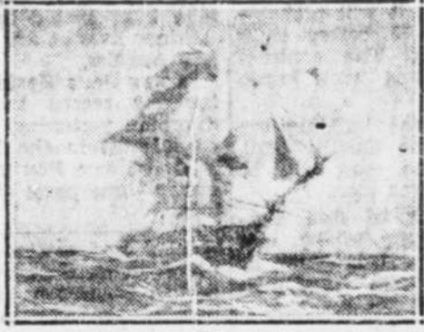
THE UNITED STATES FRIGATE CONSTITUTION

Has your name been recorded on the Honor Roll of contributors to the fund for rebuilding the Constitution? When "Old Ironsides" appears once more in our ports and harbors, under full sail, and equipped as she looked at the height of her brilliant career, will you find satisfaction in the fact that your contribution helped make possible her perpetuation as a National Naval Memorial?