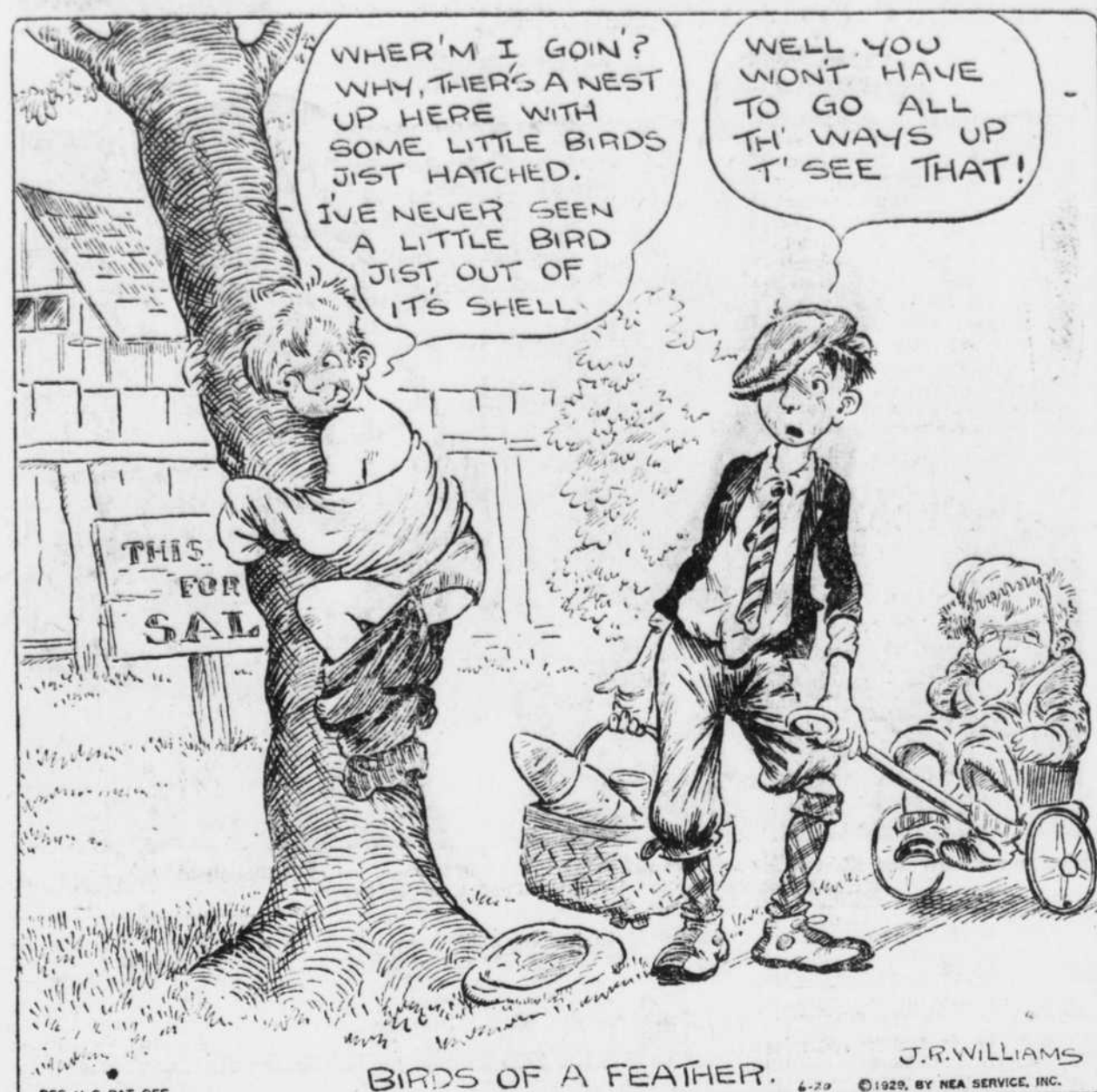
REG. U. S. PAT. OFF. BIRDS OF A FEATHER. © 1929, BY NEA SERVICE, INC.