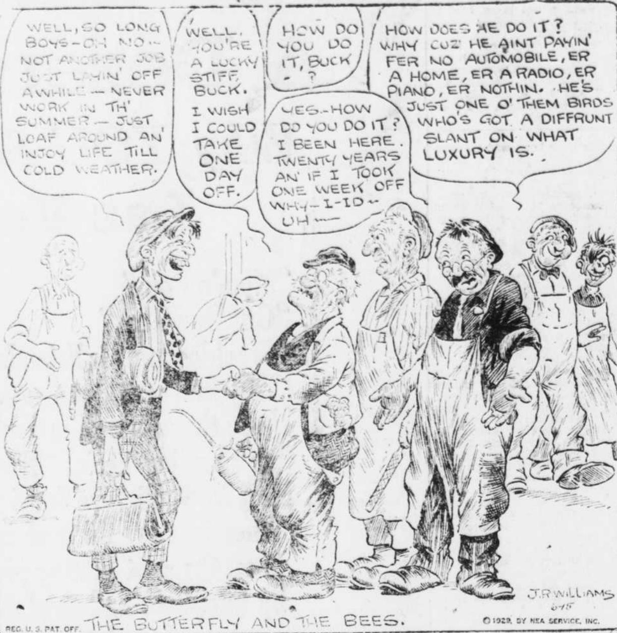
REG. U. S. PAT. OFF. THE BUTTERFLY AND THE BEES. © 1929, BY NEA SERVICE, INC.