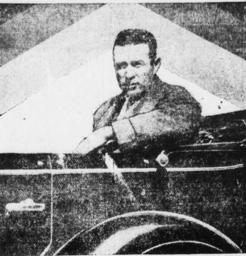
Frank "Lefty" O'Doul, this season's National League hitting sensation, turned to this 1929 Buick phaeton for transportation during his recent sojourn on the Pacific Coast. "Lefty," hitting high in the 400 class with the Philadelphia Nationals, is a product of the Pacific Coast League.