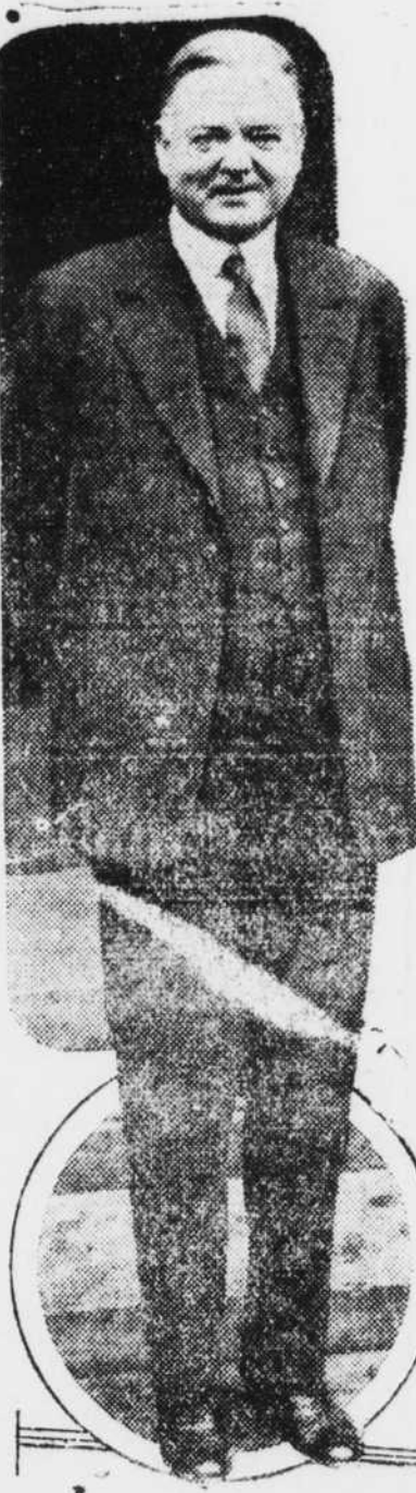
President Herbert Hoover, who yesterday issued a proclamation that the Boulder Dam legislation passed six months ago by congress is now in effect. President Hoover has ever been one of the staunchest workers for the project.

Pursuant to the provisions of Section 4 (A) of the Boulder Canyon Project Act approved December 21, 1928 (45 Stat. 1075), it is hereby declared by public proclamation: