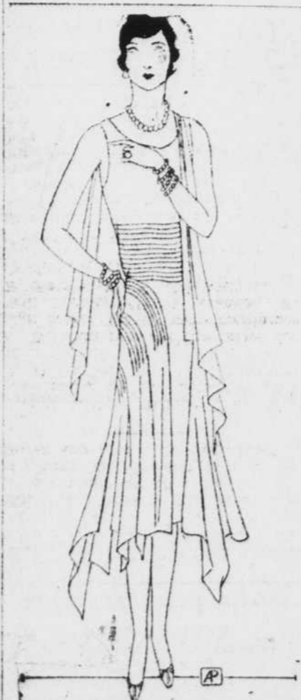
Clean Labour Dance Frock (checked White Chiffon Small Pared Draperies) and Irregular Beading