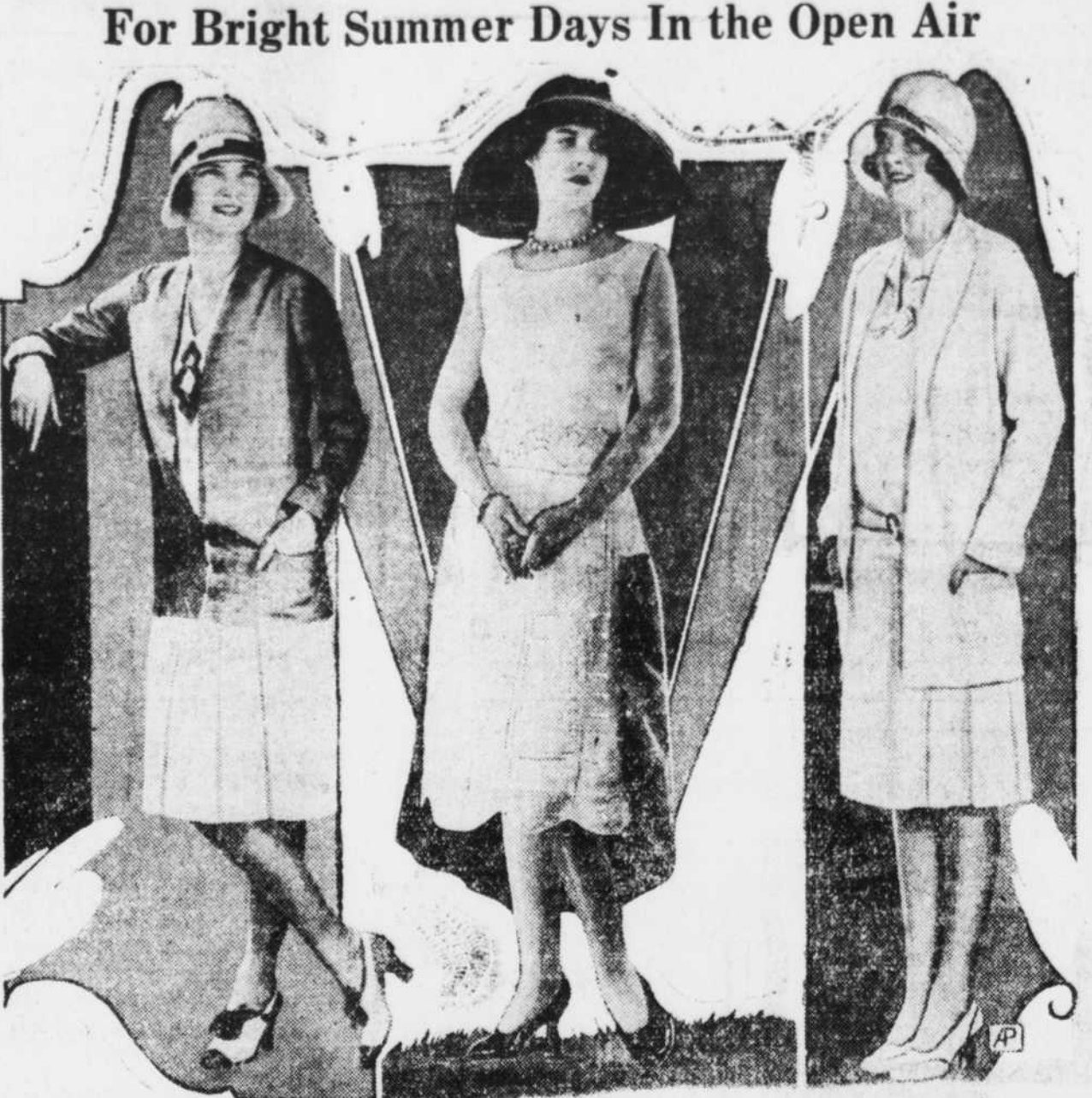
Left: A copy of a "London Trades" sport costume in Shantung with which is worn a jacket in contrasting colors. Shown by Best. Garden frock of white. Right: Neat ensemble of quilted silk coat and felt; picture hat of black maline. Shown by Bruck Witt embroidered organdie with flounce of black tulle; silk tennis dress, shown by Best.