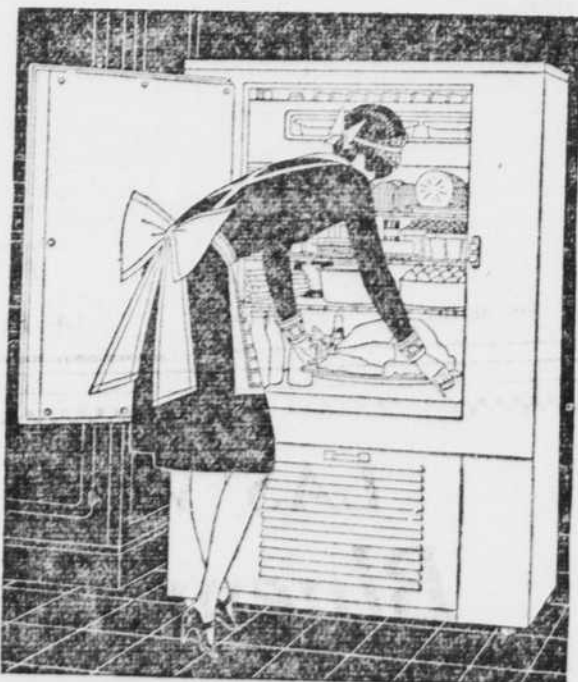
BEAUTIFUL DESIGN: Kelvinators are planned by artists, they are modern—reflecting the new tendencies in design. They are sturdy, strong and graceful, two-toned finish and some models in brilliant, cheerful colors.