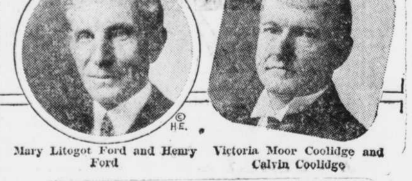
Mary Litogot Ford and Henry Ford Victoria Moor Coolidge and Calvin Coolidge