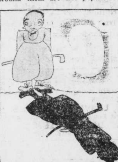
any golf course.

Events which cast their shadows before them may be popular and all that but golfers who cast their shadows before and all around them are not popular on