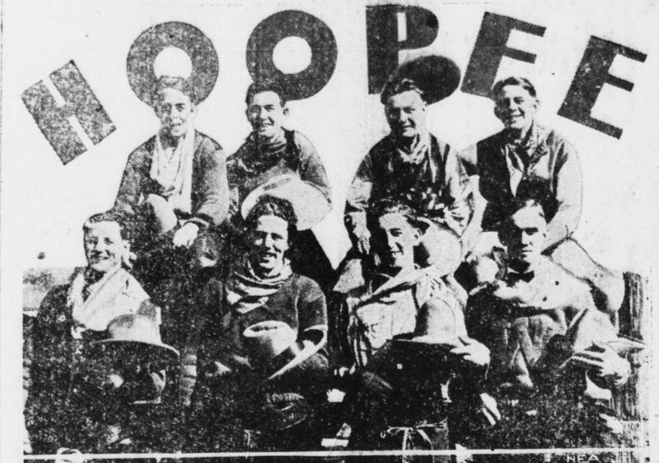
It's a wild and woolly outfit that will represent the sovereign state of Nevada at the national basketball tournament for high schools at Chicago, beginning April 2. It's the Winnemucca High School team, known as the Buckaroo squad, and the boys went east in the habiliments of cowboys.