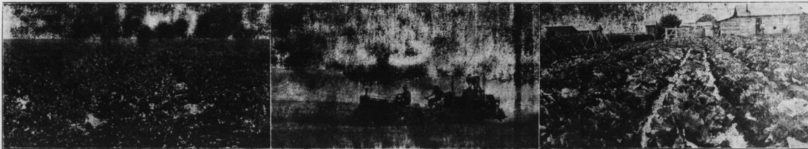
Three of the most profitable crops in the Beryl, Utah, district, in addition to alfalfa and alfalfa seed, are potatoes, wheat, and cabbage, pictured above—from photographs taken on our land.