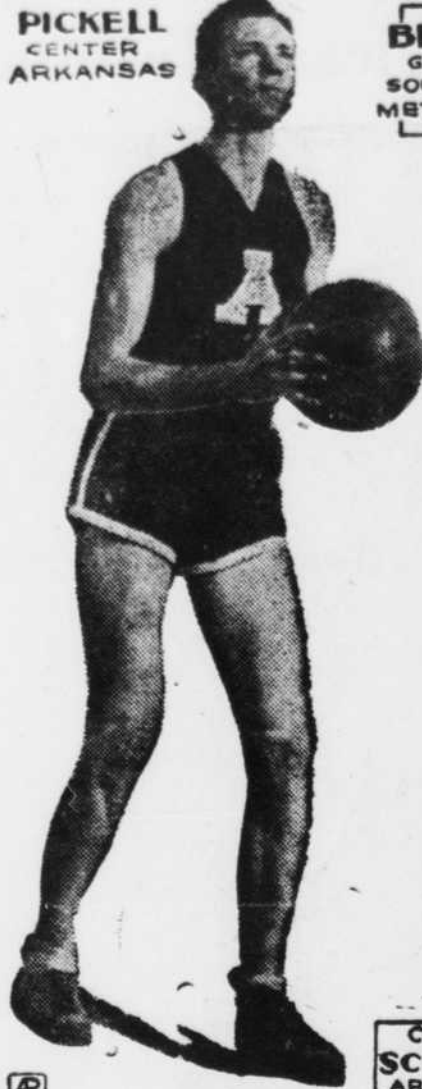
PICKELL CENTER ARKANSAS