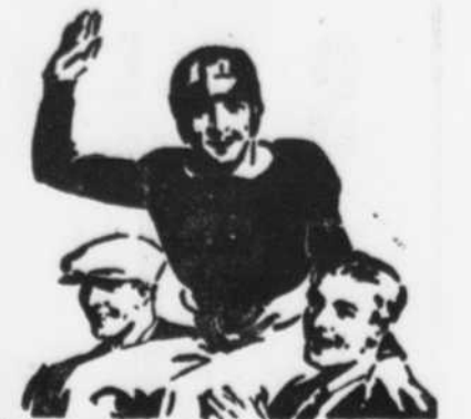
"SOMETHING TO SHOUT ABOUT!"