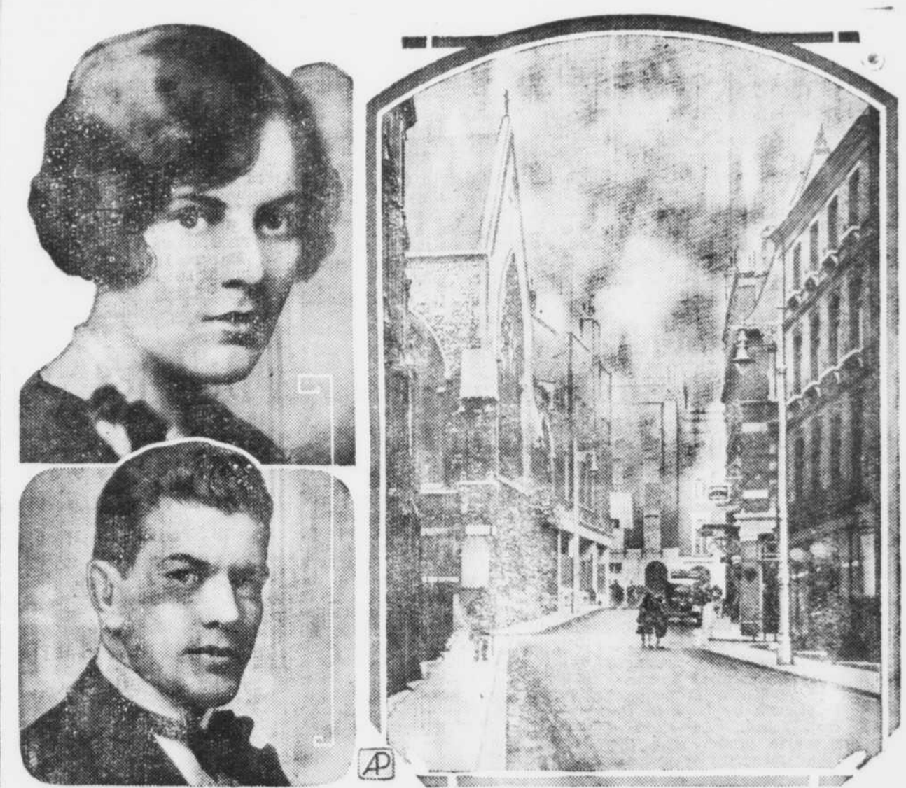
When Mr. and Mrs. Gene Tunney (left) return from their honeymoon in Italy to take up their residence, temporarily at least, in London's exclusive Mayfair, they will have for a near neighbor Bombardier Wells, English "gentleman boxer, who, like Tunney, has now retired from the ring. The Tunney apartment on Down street (above) is in the row on the left of the picture.