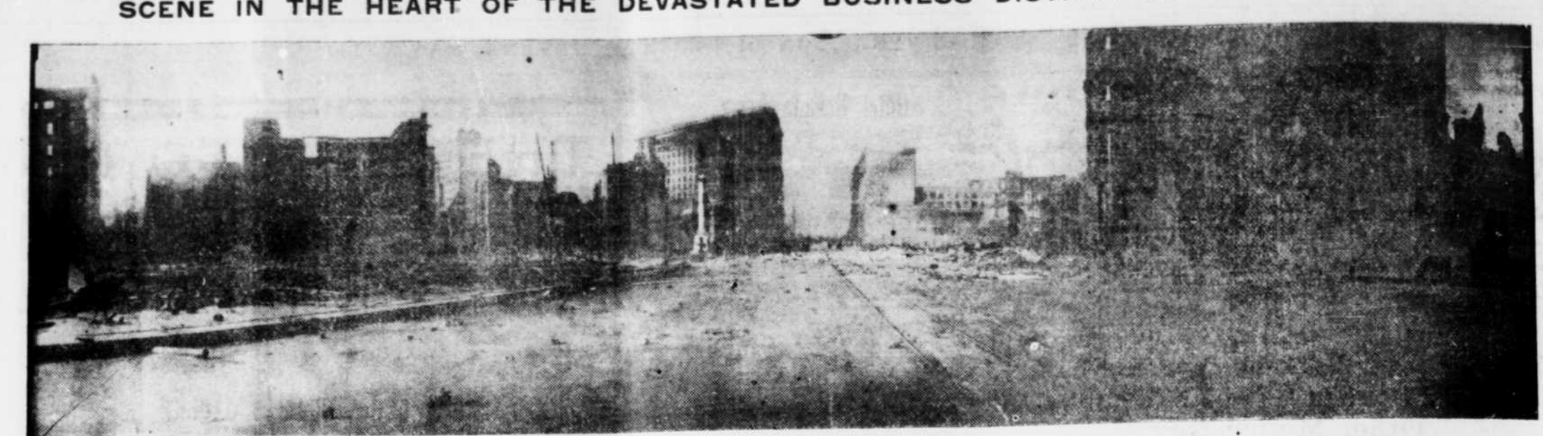
LOOKING DOWN MARKET STREET TOWARD THE FERRY FROM THE JUNCTION OF MARKET AND SIXTH. THE NATIVE SONS' MONUMENT AT THE JUNCTION OF MARKET, MASON AND TURK STREET.

SCENE IN THE HEART OF THE DEVASTATED BUSINESS DISTRICT AT SAN FRANCISCO