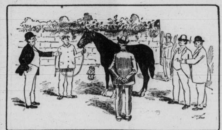
A select coterie of prominent citizens went over to the Wheels stable to look him over.

A prolific cause of chronic indiges tion is eating from habit, and simply because it is meal-time and others are eating. To eat when not hungry is to eat without relish, and food taken without relish is worse than wasted. Without relish the salivary glands do not act, the gastric fluids are not freely secreted, and the best of foods will not be digested. Many perfectly harmless dishes are severely condemned for no other reason than that they were eaten perfunctorily and without relish and due insalivation. Hunger makes the plainest foods enjoyable. It causes vigorous secretion and outpouring of all the digestive fluids-the sources of ptyais one of the saving graces. It has a When the railroad man asked the spiritual significance only through its Bronco Jack said, "A century and a portance. If breakfast is a bore or half," Mr. Wheels closed with him for lunch a matter or indifference, cut