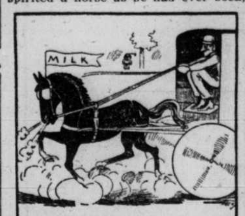
Prancing up and down in front of a milk cart.

One fine morning in Pierre, while the general manager was taking his morning run on the back of a livery stable horse, he saw something coming down the street that held his attention. It was as handsome and spirited a horse as he had ever seen,