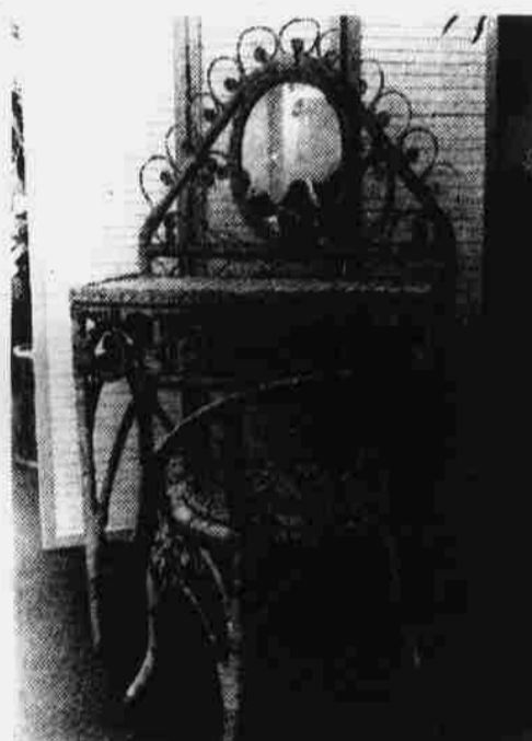
Vanity w/mirror and Chair Set White or Nat. Wicker $11900 BC023