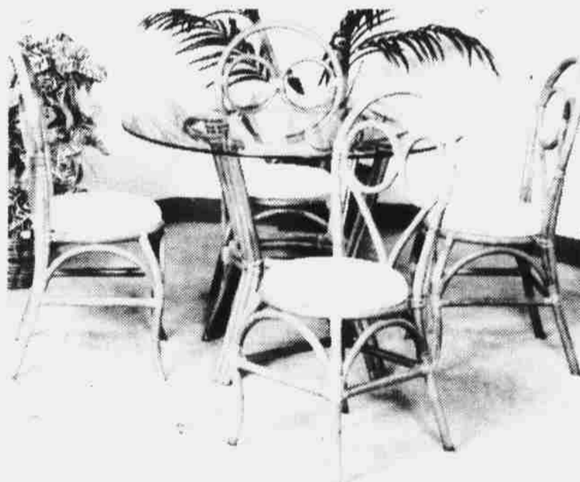
Five Pc. Rattan Dining Sets Three Finishes - $23900 From