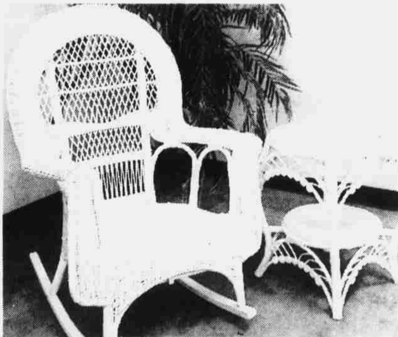
Wicker Rockers - White or Natural Finish $5900