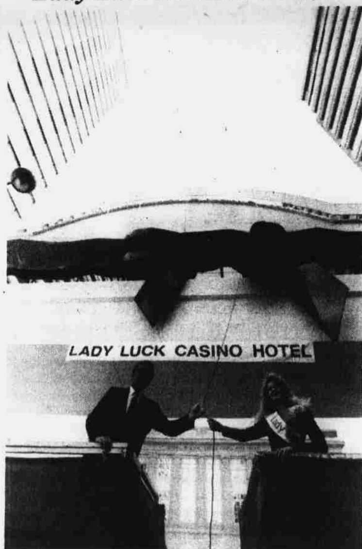
The worlds largest ribbon and bow seperated and Lady Luck became the third largest and newest casino hotel in downtown Las Vegas recently. Mayor Ron Lurie, left, and "Lady Luck", right, dropped the bow celebrating the new 400 room Tower West. Now with 800 rooms, five unique restaurants, a swimming pool, parking garage and 40,000 square foot casino, Lady Luck Casino Hotel is celebrating a year long Silver Anniversary with non-stop parties, giveaways and special events. Call 1-800-LADY LUCK for more information.