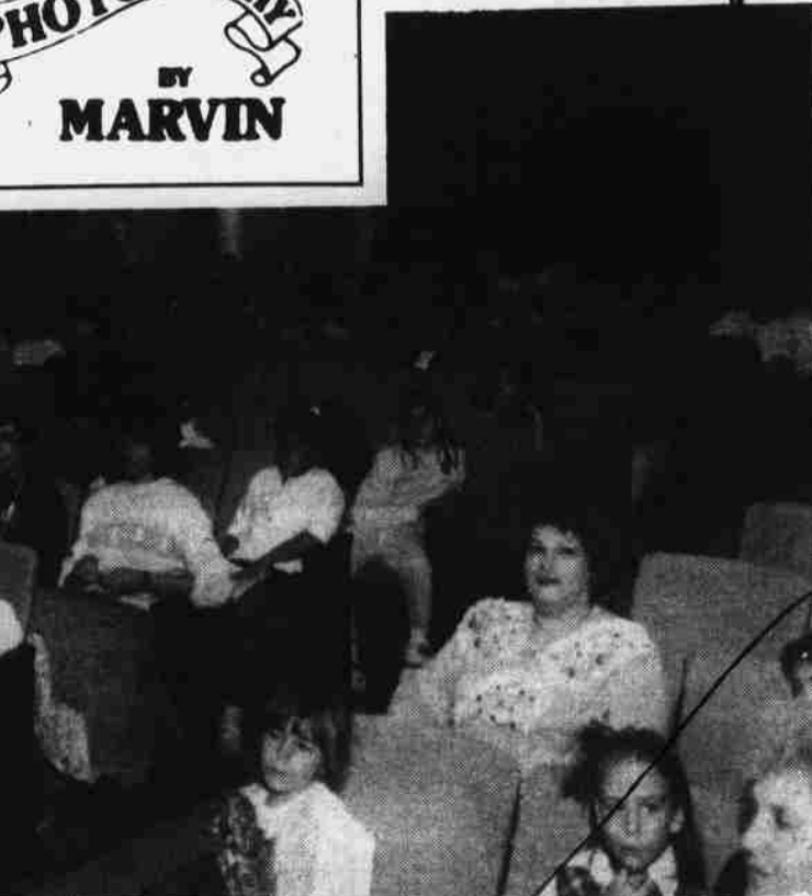
The audience appreciating the Nate Mack Religious School Holiday Songs & PLays