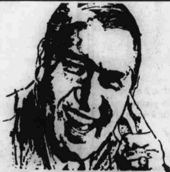
HENNY YOUNGMAN ...Man of Many Talents.

The candidate was asked, "What do you think of the abortion bill?" He replied, "I paid that doctor."