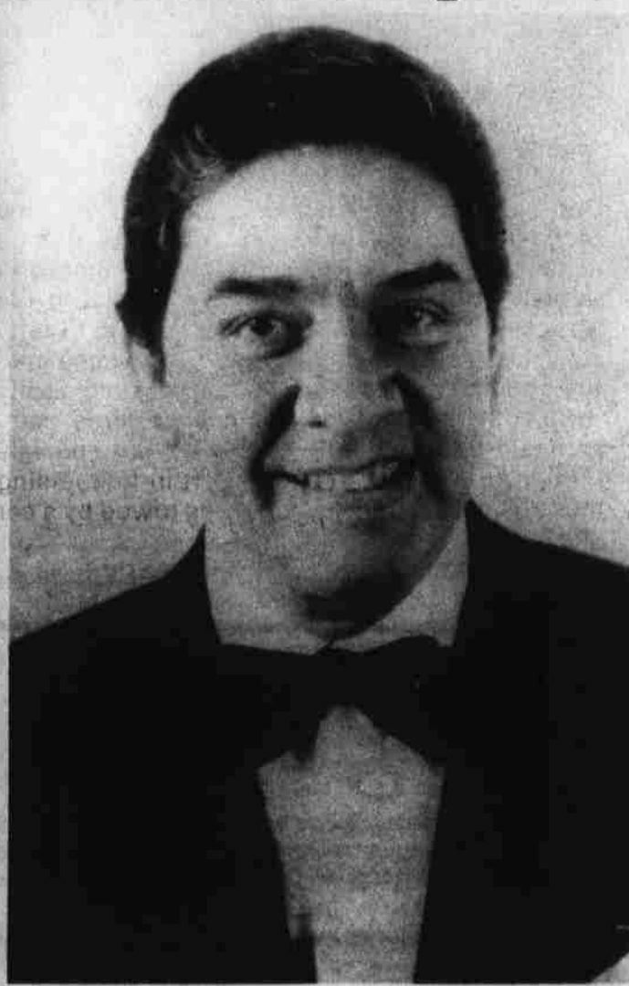
MARCO ANTONIO MUNIZ

Caesars Palace presents "Lo Mejor del Mundo Latino 1988 (The Best of the Latin World 1988) - Rocio Jurado & Marco Antonio Muniz" in concert on April 2.