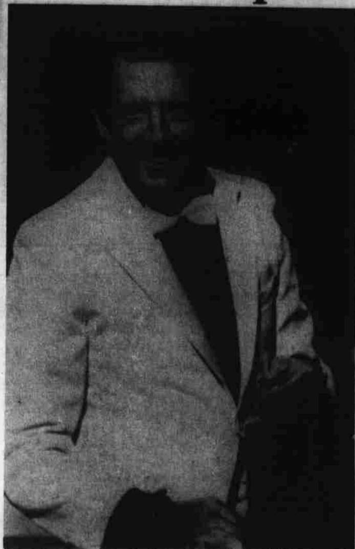
Jerry Lee Lewis