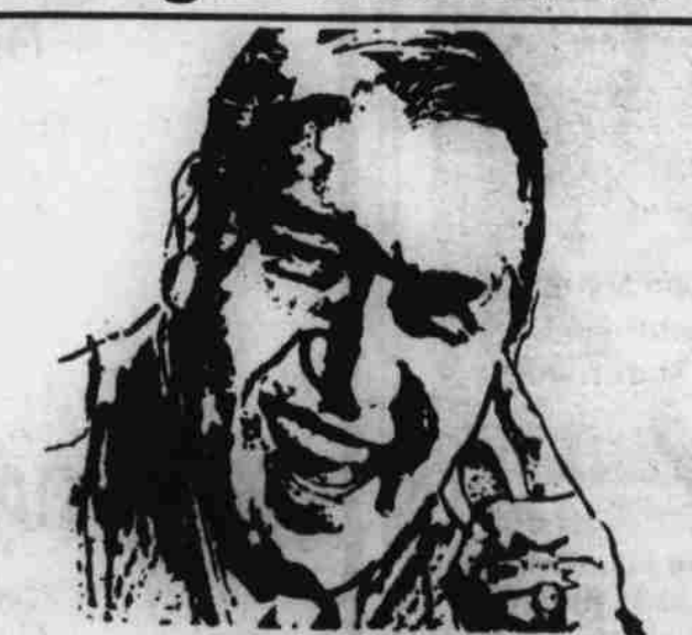
HENNY YOUNGMAN ... Man of Many Talents.

I'm on a seafood diet - I see food and I eat It!