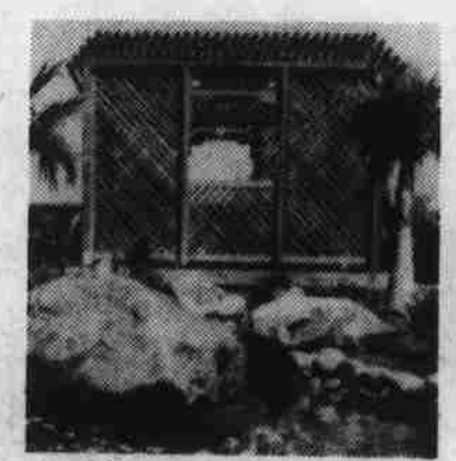
Beautiful, private ponds and outdoor gazebo are available for your entertaining needs.

tuxedo clad waiters • musicians champagnes & fine wines gourmet menu selections floral arrangements • decorations audio/visual services photography