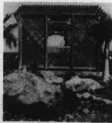
Beautiful, private ponds and outdoor gazebo are available for your entertaining needs.

Let us coordinate your next gala occasion... From your invitations to the transportation of your guests. Or reserve The Sterling Room to host your own special event.