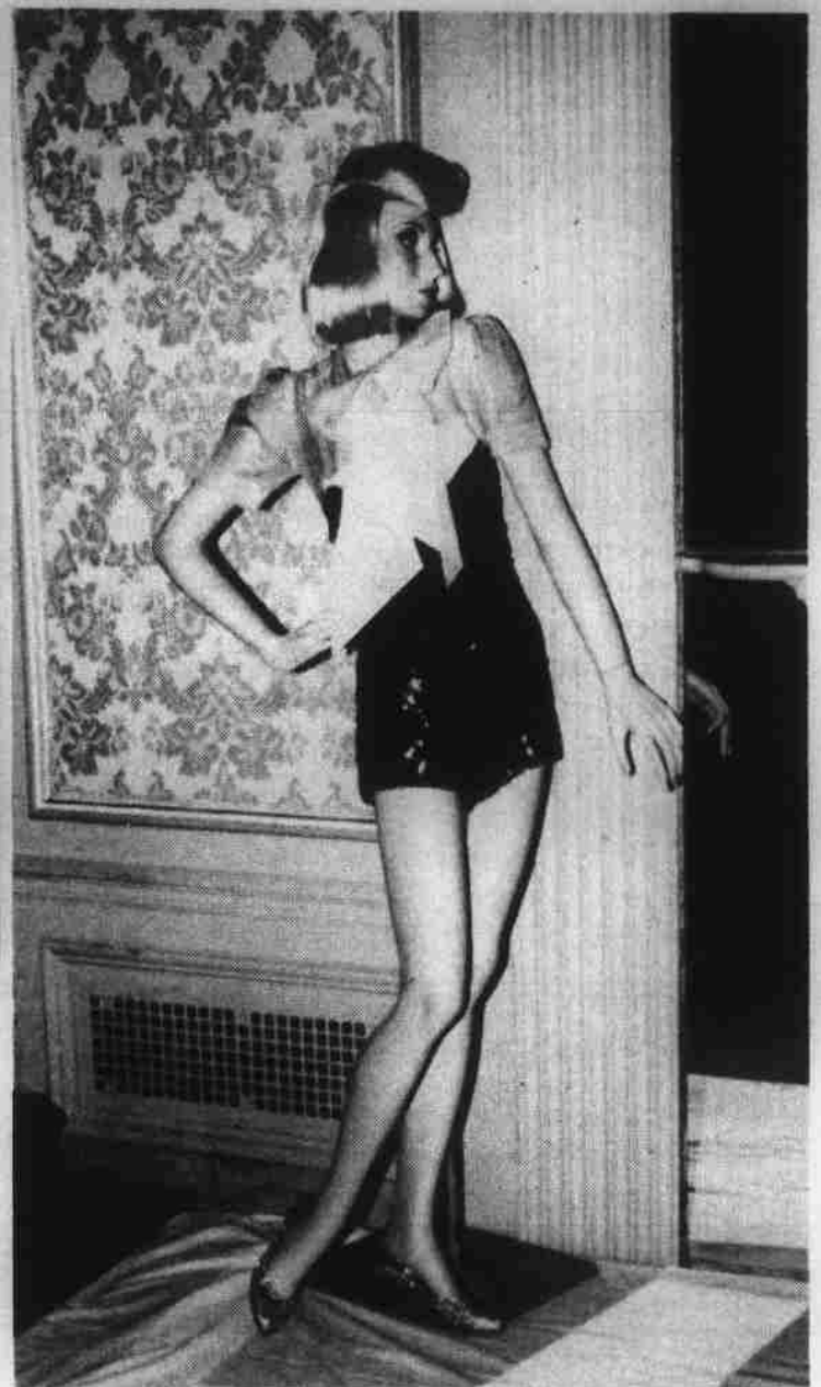
This hot-pants jumpsuit with a pussycat bow, designed by Arnold Scassi in 1966, is among acquisitions for Shenkar College's newly-established active-museum of textiles, apparel and fashion design, the first of its kind in Israel.

and historic sites and a stay at a first class or superior first class hotel, for as little as $175 plus airfare.